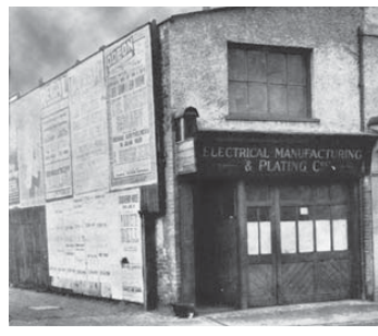
The first home of Celestion in Hampton Wick