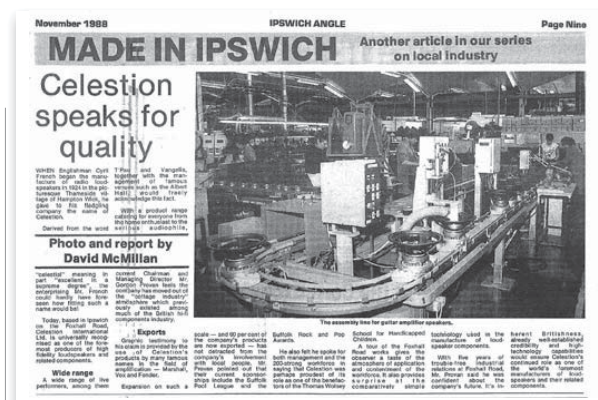
A 1988 newspaper article on the Foxhall Road factory

Since then, Ms Potter has seen Celestion change again. The Foxhall