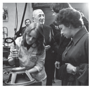
Princess Margaret visited the Foxhall Road factory in 1977